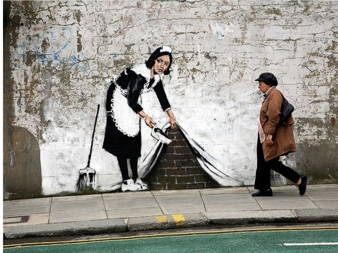
BANKSY (2006) SWEEPING IT UNDER THE CARPET. STENCIL GRAFFITI ON A WALL IN LONDON.

The metaphor depicted in the work reflects the denial of governments to deal with global issues such as the AID epidemic, climate change, etc.