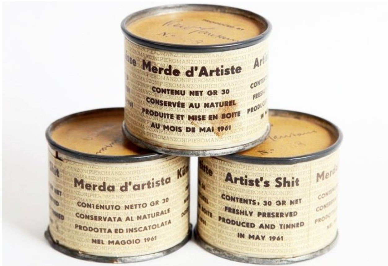
PIERO MANZONI (1961) MERDA D'ARTISTA (ARTIST'S SHIT) 90 tin cans, each filled with 30 grams of human feces.