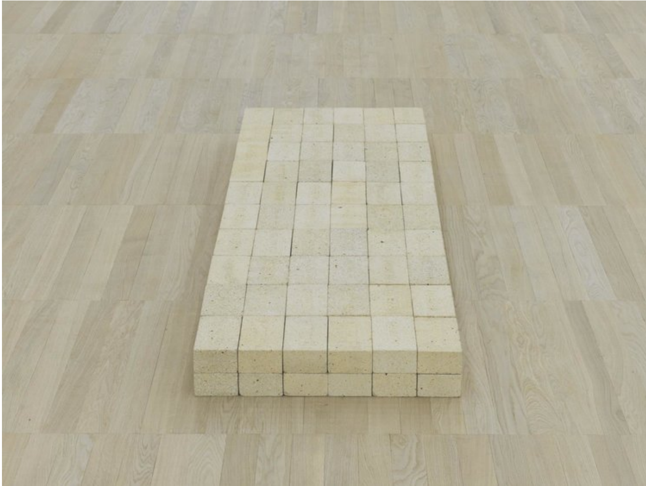
CARL ANDRE (1966) EQUIVALENT VIII. 120 INDUSTRIAL FIRE BRICKS. Minimalist sculpture of fire bricks arranged in two layers on the Tate Gallery floor.