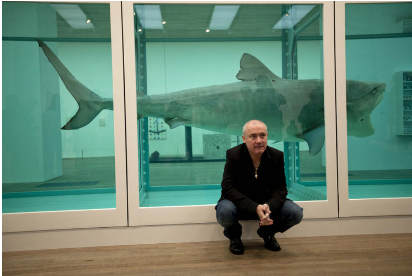
DAMIEN HIRST (1991) THE PHYSICAL IMPOSSIBILITY OF DEATH IN THE MIND OF SOMEONE LIVING.

The art object consists of glass, painted steel, silicone, monofilament, shark and formaldehyde solution.