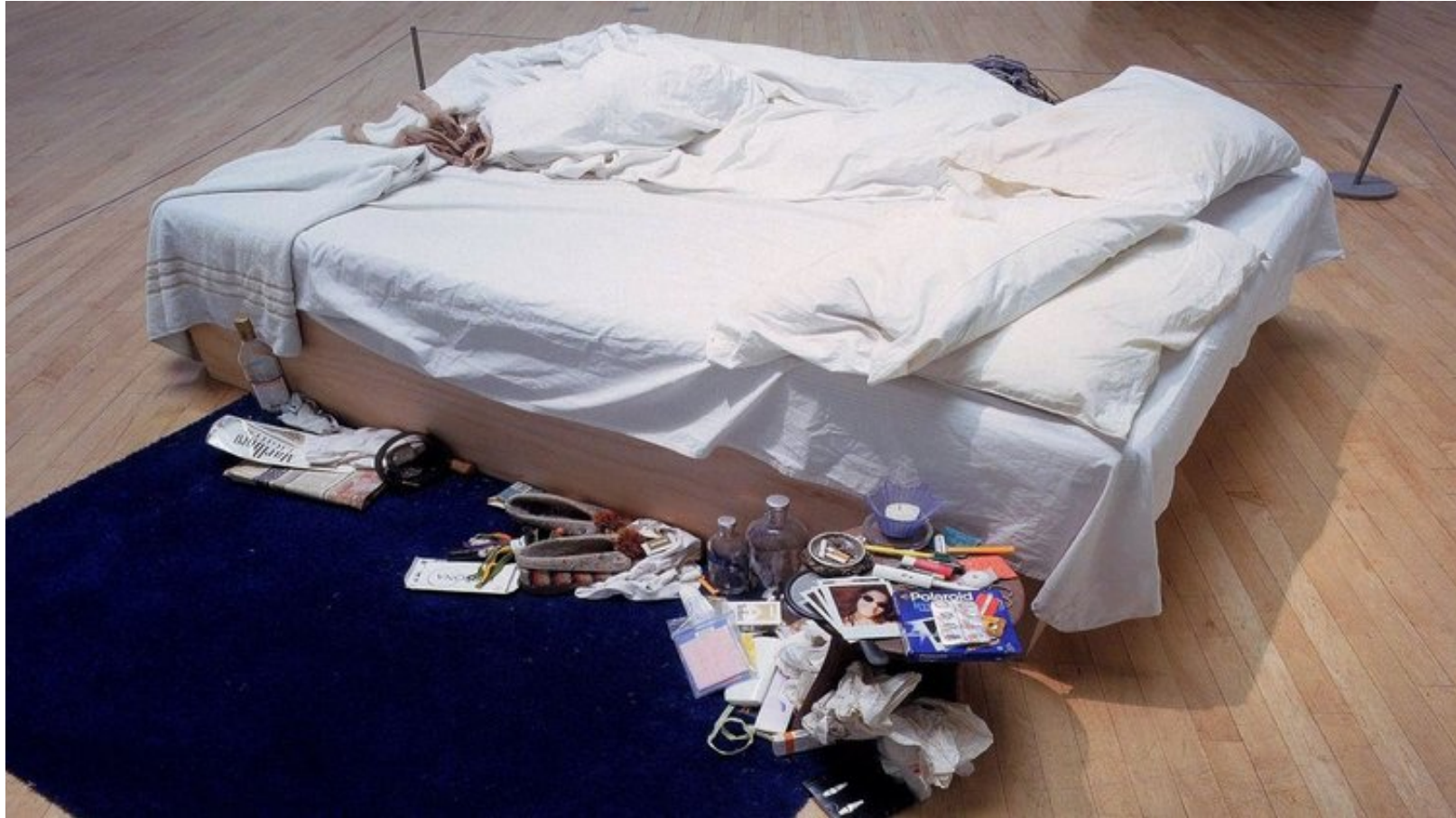
TRACEY EMIN (1998) MY BED.

The installation consists of the artist's unmade bed and personal items arranged just as they were left, supposedly after several days of alcohol and sex.