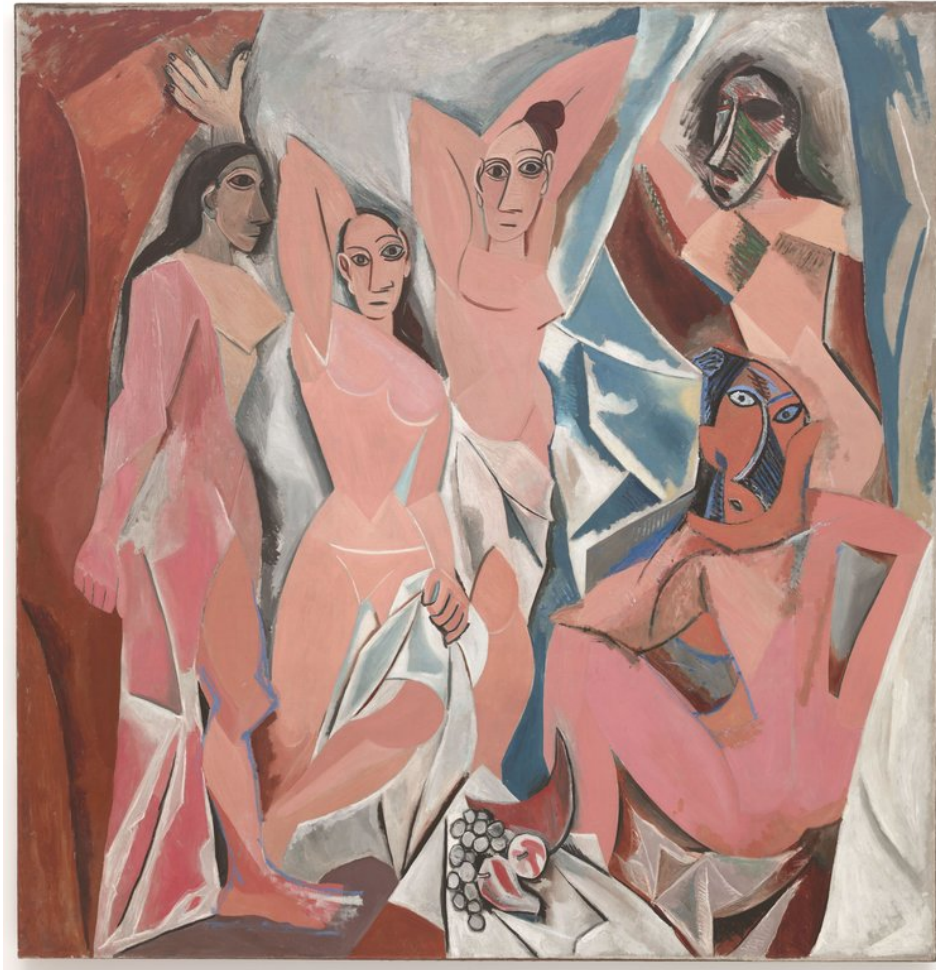
PABLO PICASSO (1907) LES DEMOISELLES D'AVIGNON. Oil on canvas. The Museum of Modern Arts, New York.