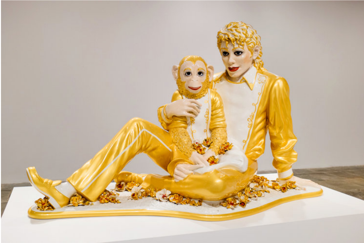
JEFF KOONS (1988) MICHAEL JACKSON AND BUBBLES. Four life-sized versions were made by Italian porcelain craftsmen to the artist's design.