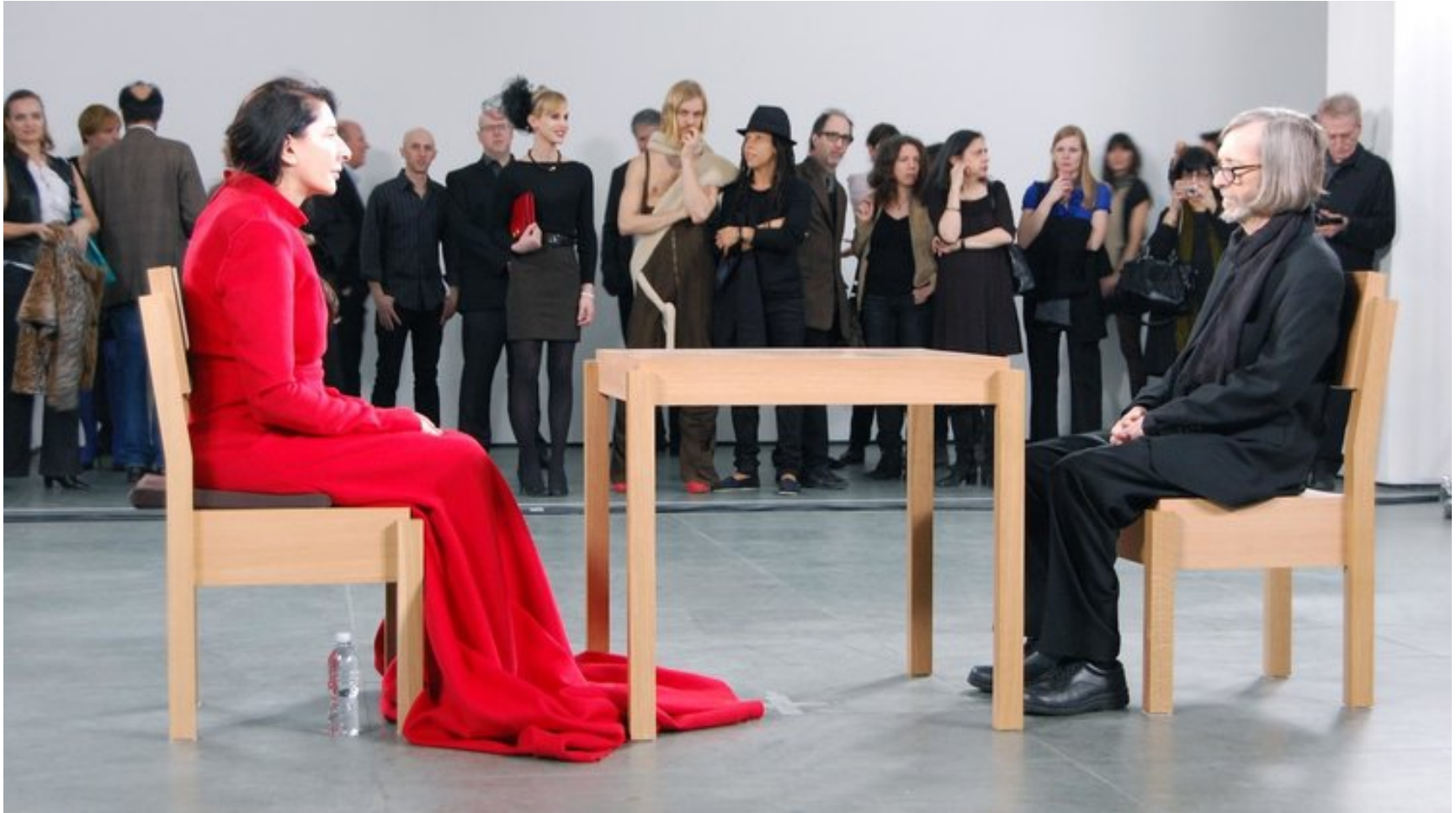
MARINA ABRAMOVIC (2010) THE ARTIST IS PRESENT: A PERFORMANCE ART PIECE AT MOMA, NEW YORK.

"Sit silently with the artist for a duration of your choosing"